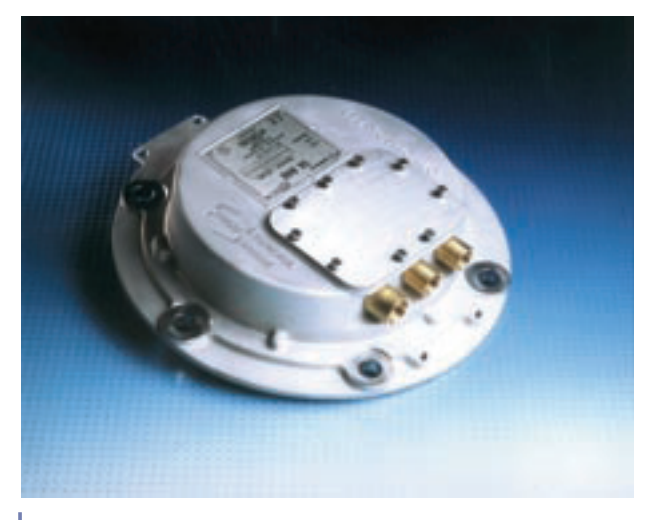
Auxitrol TA- 840 Radar