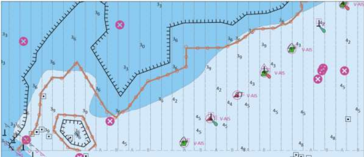
Two automatically created 'no-go' areas. Source: ECDIS Procedures Guide 2024 - 2025 by Witherbys